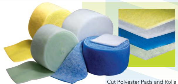
Cut Polyester Pads and Rolls