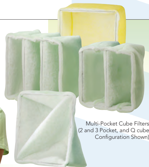
Multi-Pocket Cube Filters (2 and 3 Pocket, and Q cube Configuration Shown)