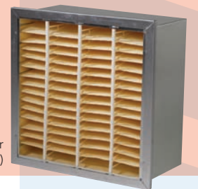
QualityCell, QualityFlow without Header