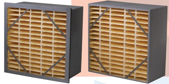
Plastic box, with Header

The QualityCell from Quality Filters is specifically designed for variable air volume systems and turbulent air. These rigid cell filters provide high efficiency filtration in difficult operating conditions where indoor air quality is critical.