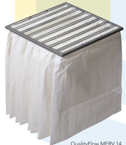
QualityFlow MERV 14